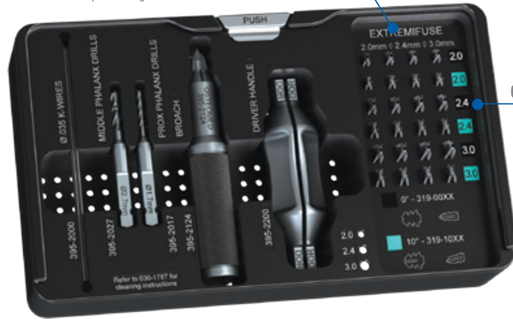
395-4000 ExtremiFuse Organizer Block