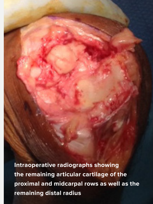
Intraoperative radiographs showing the remaining articular cartilage of the proximal and midcarpal rows as well as the remaining distal radius

Digital range of motion was started immediately postoperatively, and strengthening was started approximately two weeks out from surgery.