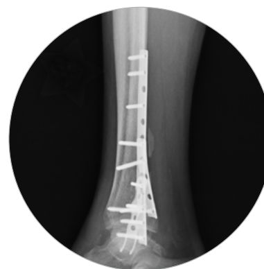
8 weeks postoperative

This fracture type requires a thorough understanding of the fracture mechanism, bone quality, and surgical approach. Ankle fractures present many variations. The necessary tools, instruments, plates, and screws required to complete ORIF of ankle fractures are all included in the Acumed Ankle Plating System 3.