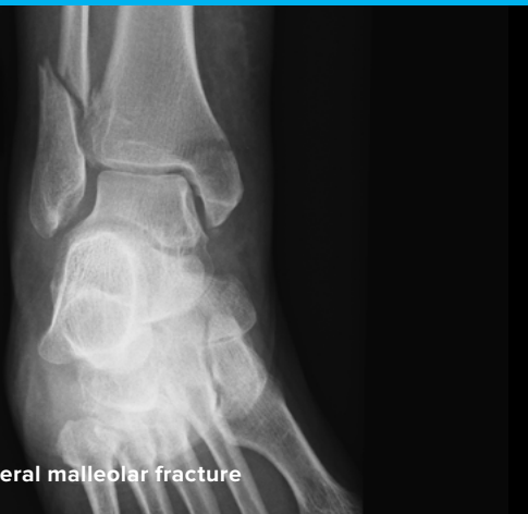
X-ray showing lateral malleolar fracture