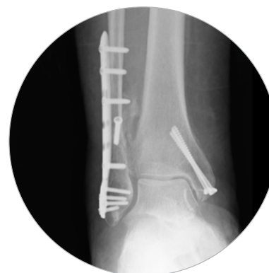
10 months postoperative

This fracture pattern can be difficult to treat due to the fibular comminution. The necessary tools, instruments, plates, and screws required to complete ORIF of ankle fractures are included in the Acumed Ankle Plating System 3. The Lateral Fibula Plate has an excellent fit. With anatomic rigid fixation, the patient was allowed to weight-bear earlier, allowing faster rehabilitation.